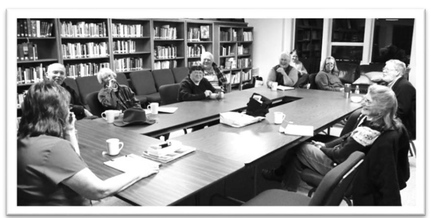
Adult Faith Formation in the Library

Adult Faith Formation has taken many shapes, including focus on the Sunday readings, Bible studies, Education for Ministry, book studies, discussion groups, author studies, films, and special events such as Earth Day, Quiet Days, and events in the diocese.