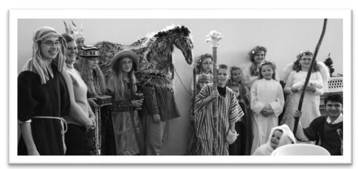
Preparing for the Epiphany Pageant

Christian faith. Many children of all ages participate in the annual Christmas/Epiphany Pageant.