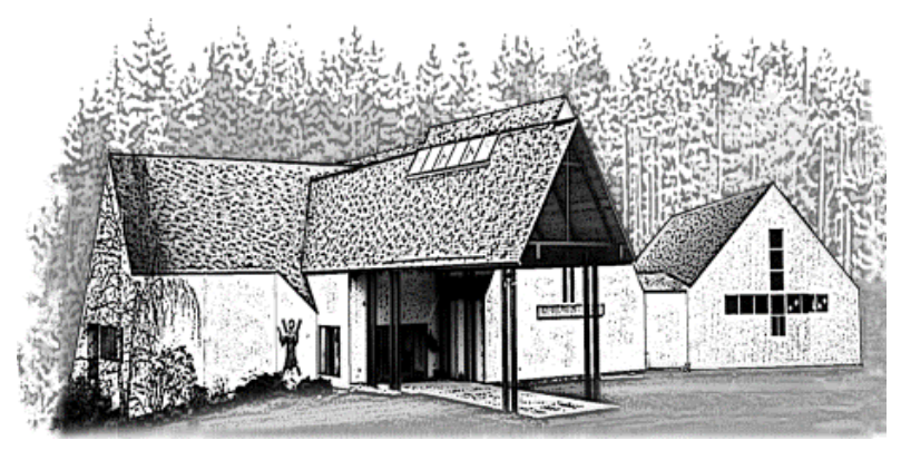
SINCE 1891, KNOWING CHRIST AND MAKING HIM KNOWN