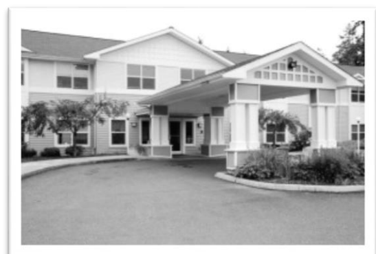
1998 - St. Andrew's Place Assisted Living

built just south of the church by the Episcopal Retirement Communities on land donated by the church. It is the only retirement community on the Olympic Peninsula that accepts Medicaid as payment. Members of St. Andrew's Church contribute to the well-bieing of the residents by providing pastoral care, May baskests, social opportunities and other assistance.