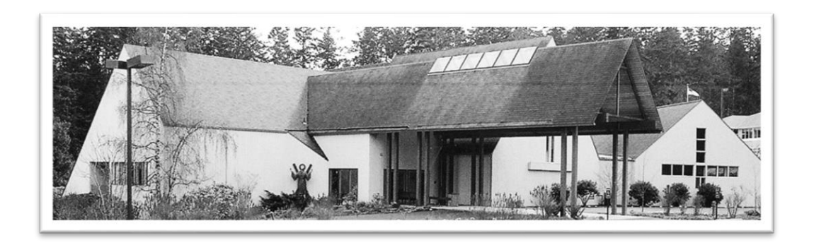
St. Andrew's Episcopal Church 2016

This list is meant to be a sampling of activities and organizations in which the people of St. Andrew's have participated. As such, it is not an exhaustive list. We give thanks to God and to our parishioners for all the time, talent, and treasure given to further the mission to know Christ and to make him known.