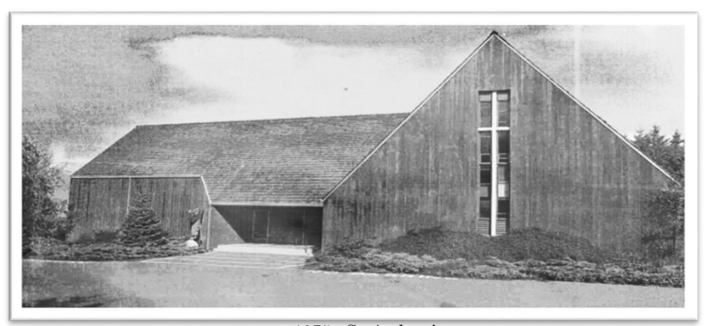
1975 - St. Andrew's

building was completed in 1971 and dedicated to the glory of God and in honor of St. Andrew, the apostle on November 30, 1971.