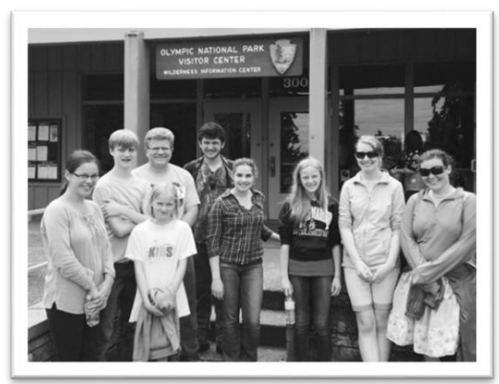
Youth Group visit to Olympic National Park

Our middle and high schoolers continue their faith formation with Rite 13 and Journey 2 Adulthood. Their experience is supplemented by activities with the youth group. Confirmation is an important milestone for these students.