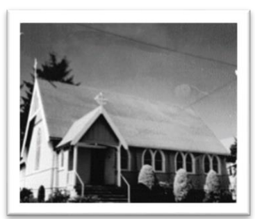
1904 Second and Peabody Streets

The new mission built its first church on the southeast corner of Sixth and Chase Streets. The formal opening was May 18, 1892 and incorporation papers were signed on March 12, 1893 .