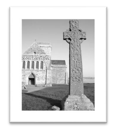
St. Martin's Cross Iona Abbey Sabbatical 2015