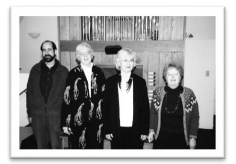
St. Andrew's Organists 2010