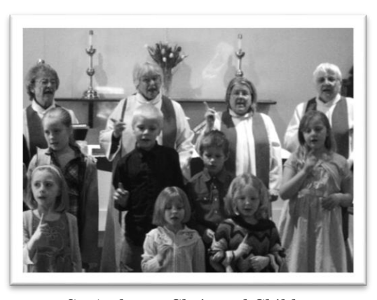
St. Andrew's Choir and Children