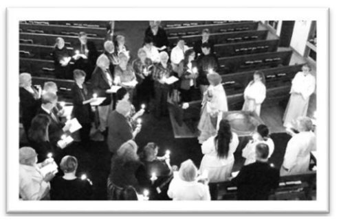
Gathered around the font for Easter Vigil