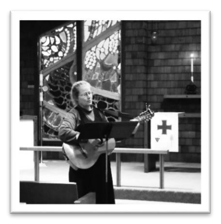
Worshipping at St. Swithin's