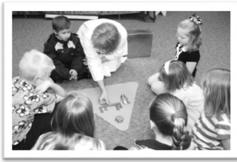
Godly Play Sunday School

In 2010, we implemented the Godly Play program for the youngest of our folks, allowing them to experience worship, stories, symbols and rituals of our